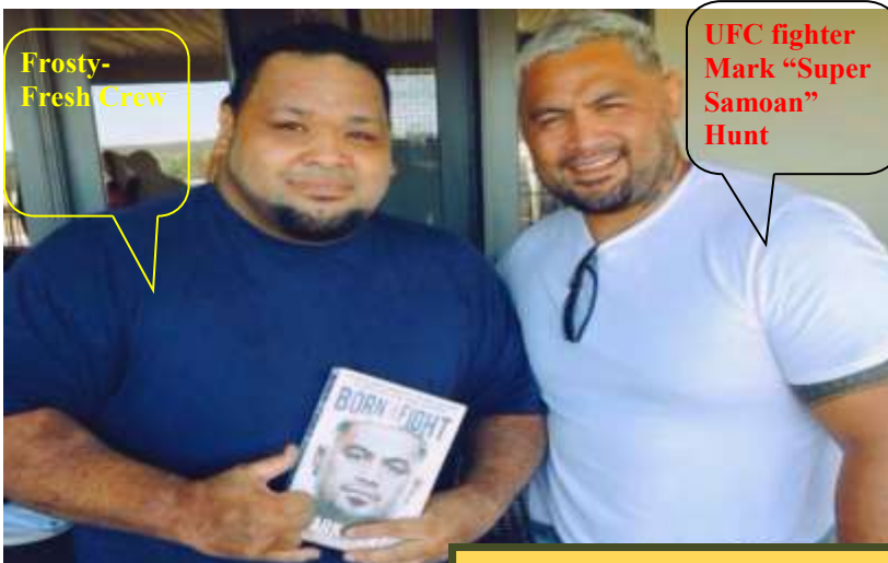
Frosty- Fresh Crew