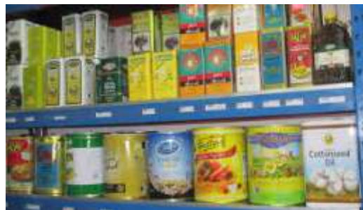
Mega Continental Foods West End

Allcare Inala Medical Centre Shop 2, Ezy Shopping Plaza, Inala http://nearyouau.com