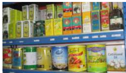
Mega Continental Foods West End

Allcare Inala Medical Centre Shop 2, Ezy Shopping Plaza, Inala http://nearyouau.com