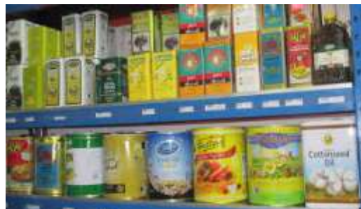
Mega Continental Foods West End

Allcare Inala Medical Centre Shop 2, Ezy Shopping Plaza, Inala http://nearyouau.com